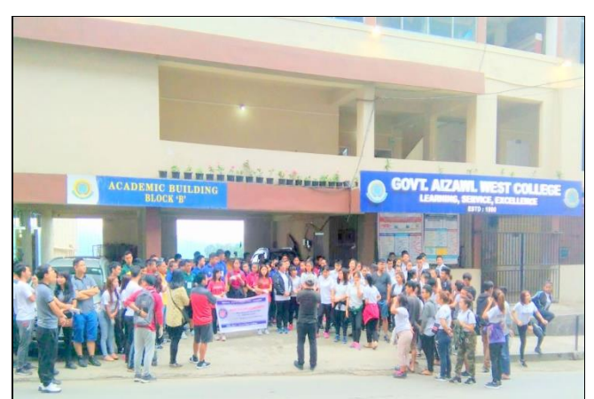
Briefing on Mass Cleanliness Drive @ GAWC