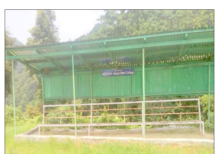
Rest Shed @ Baktawng Playground