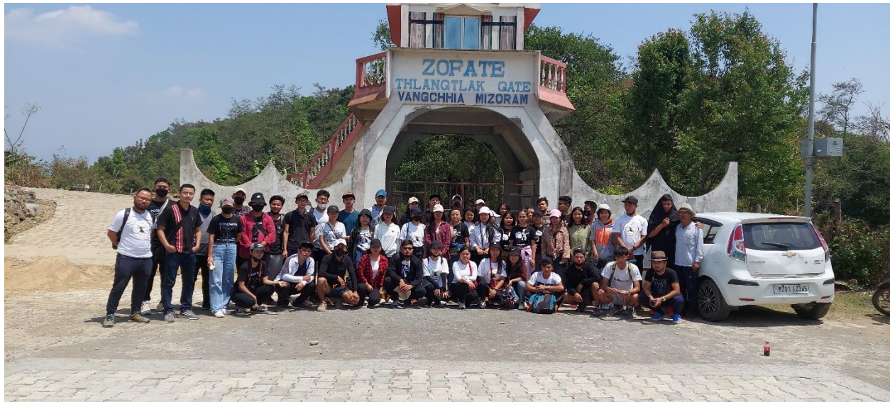
Zofate Thlangtlak Gate (Vangchhia)