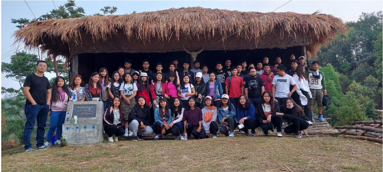
Mizo Typical Zawlbuk at Vaphai