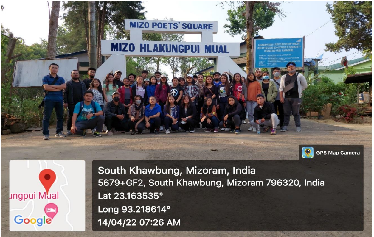
Mizo Hlakungpui Mual-1 (Khawbung)