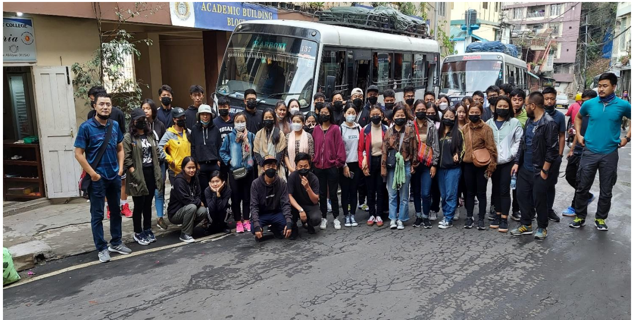
GAWC (Court Yard)