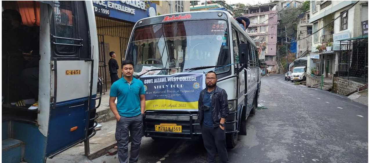
Assemble at College