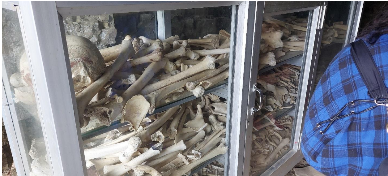
Skulls and bones remains collected from the Cave Lamsial Puk (Vaphai)