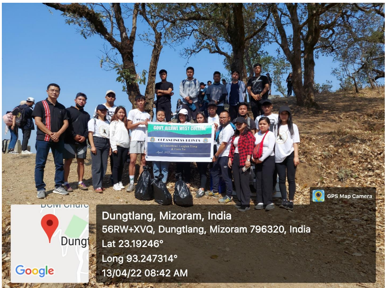
“Cleanliness Drive” at Lianchhiari Lunglen Tlang (Dungtlang)