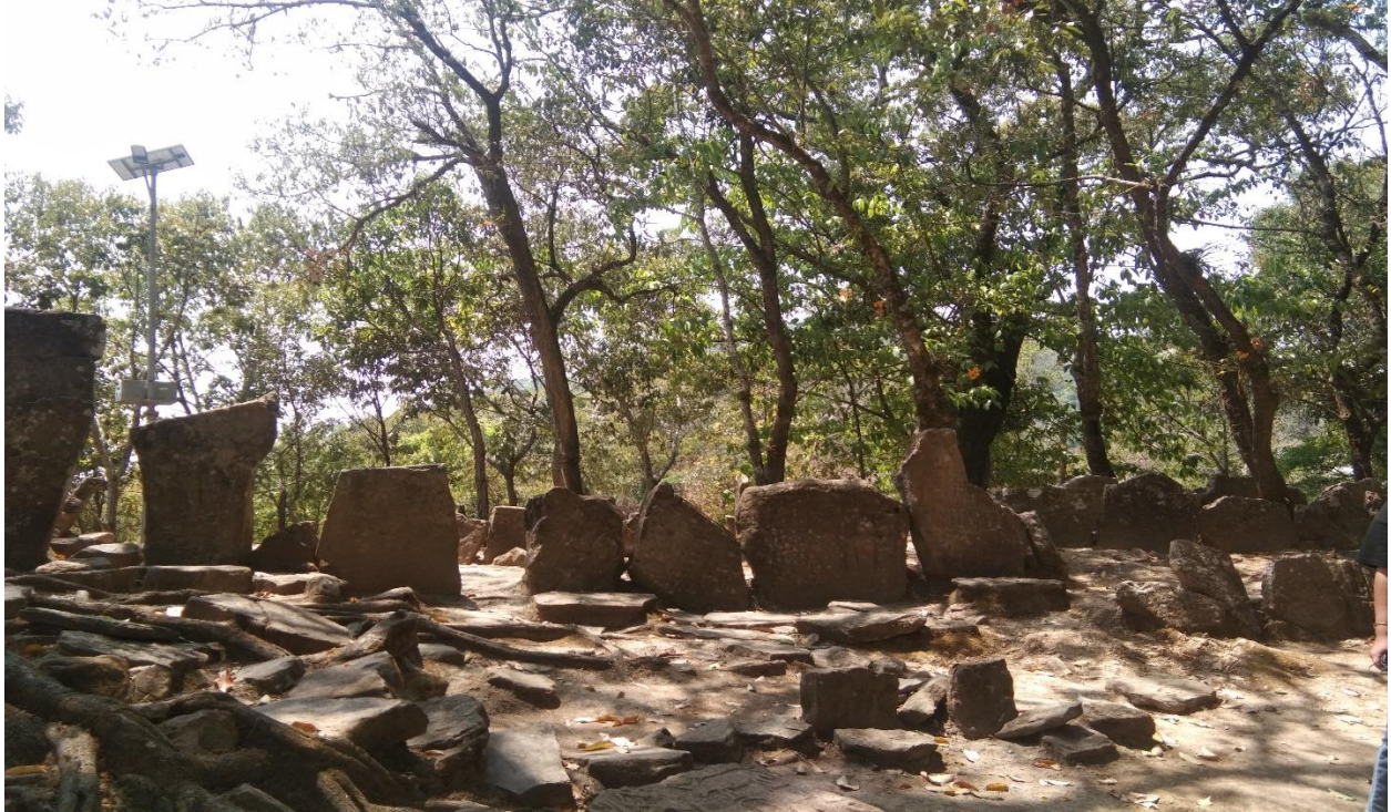
Kawtchhuah Ropui-2 (Vangchhia)