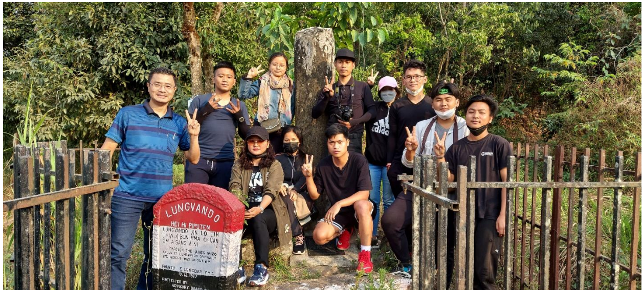
Lung Vando (Situated between E Lungdar and Biate)